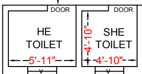
EXISTING BUILDING PLAN